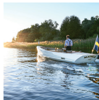
Daycruisers/ double enders