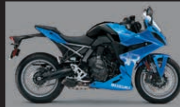
Metallic Triton Blue (YSF)