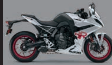
Metallic Mat Sword Silver (QKA)