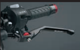
Billet Clutch Lever (Anodized)