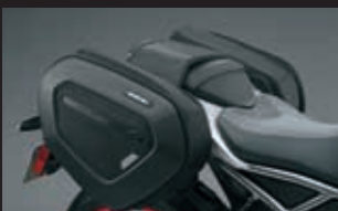
Soft Side Case Set