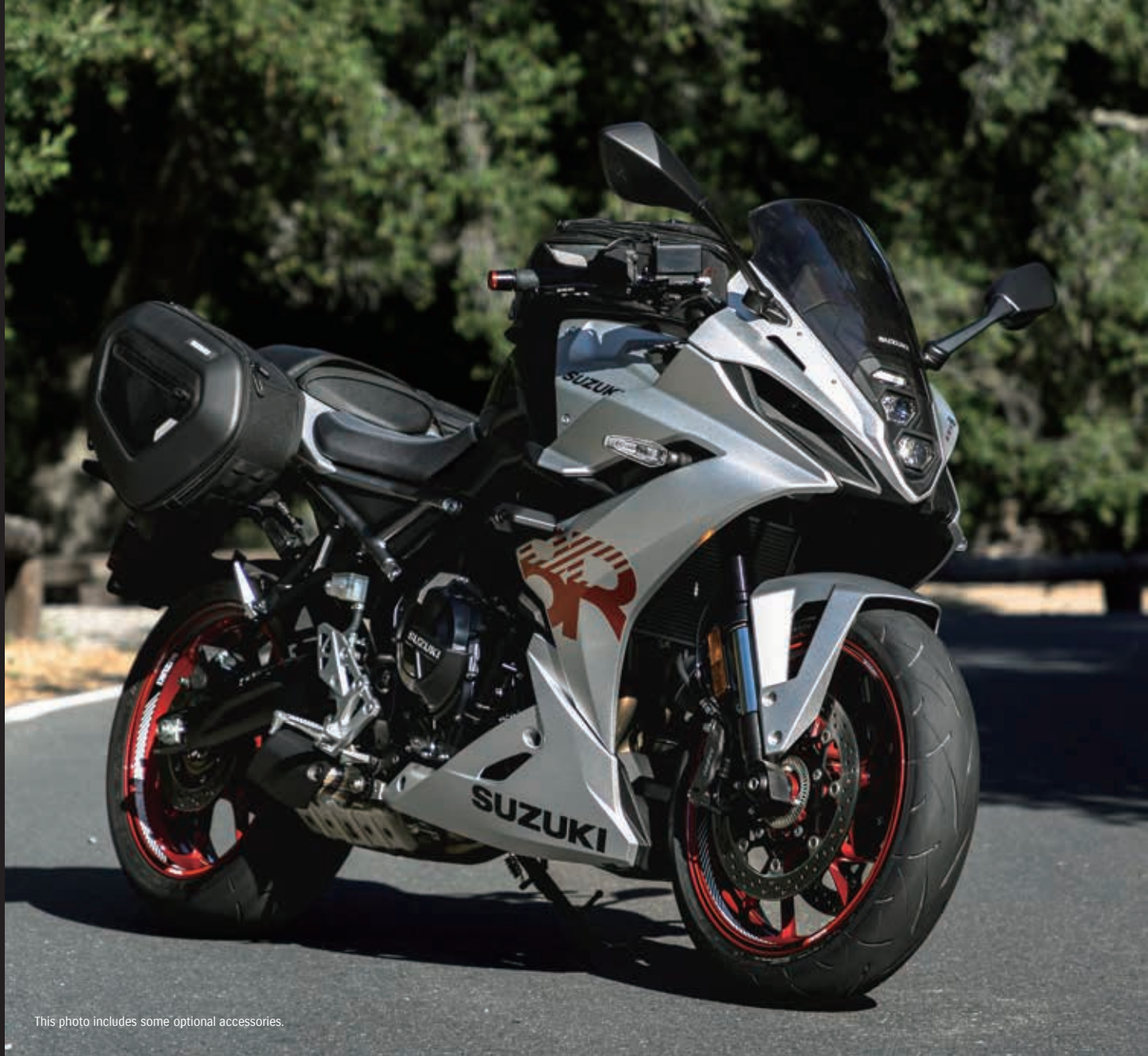
This photo includes some optional accessories.