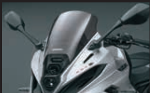
Touring Screen (Smoked Tint)