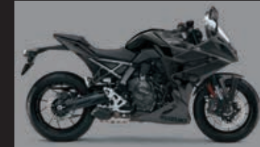
Metallic Mat Black No.2 (YKV)