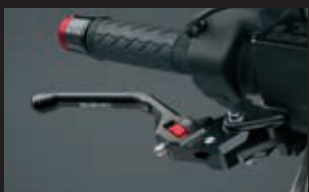
Billet Brake Lever (Anodized)