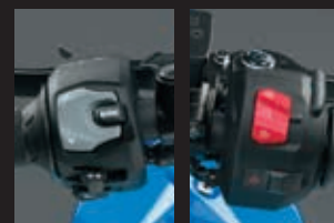
Left handlebar switch

The GSX-8R adopts a custom 5-inch color TFT LCD multifunction instrument panel. Clearly legible high-quality information displays keep you fully aware of all the bike's systems and settings, and supply vital real-time operating status information. The tachometer does double duty as a programmable rpm indicator that blinks when the engine reaches a preset speed, and the LCD now adds a function that lets you display large pop-up alerts and warnings. Manual or automatic settings for switching between the day (white) and night (black) display modes let you maximize visibility at any hour and in any riding situation.