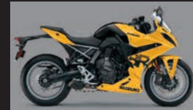
Pearl Ignite Yellow (QZY)