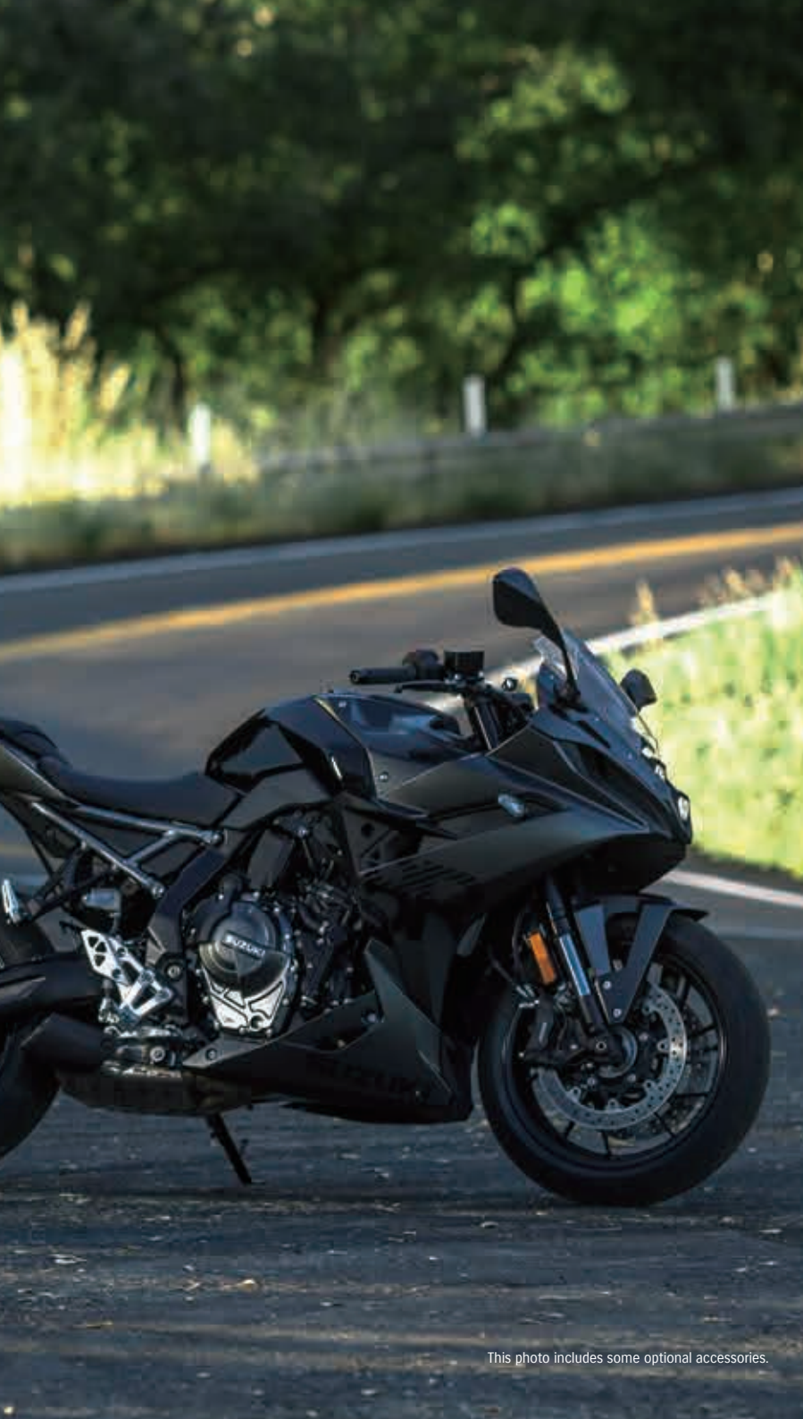
This photo includes some optional accessories.