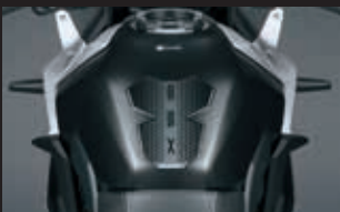
Fuel Tank Pad