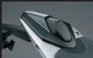
Single Seat Cowl